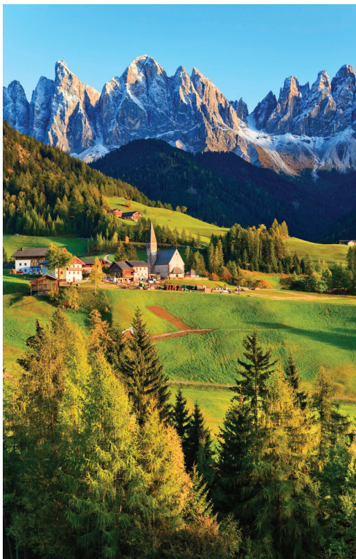
We enjoy stunning scenery in the South Tyrol.