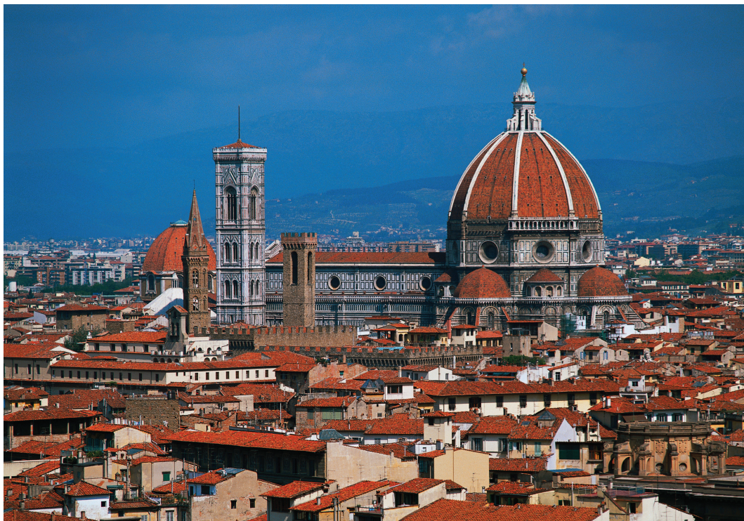
The Baptistery (l) and Duomo (r) rise above Florence's rooftops.