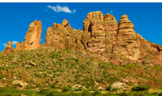
The beautiful landscape of the Gheralta region

Ethiopian children do not share a surname with their parents, instead take their father’s first name as their last name.