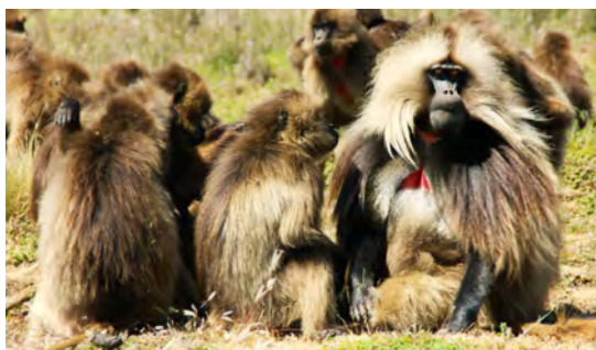
A group of gelada baboons high in the Simien Mountains