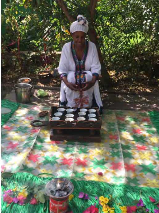
Traditional Ethiopian coffee ceremony