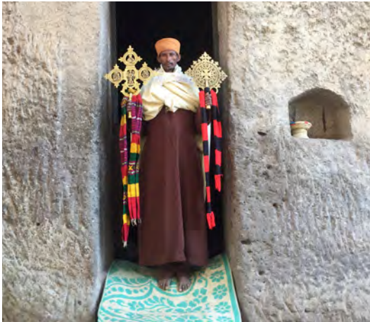
Priest at Asheton Mariam Monastery in Lalibela