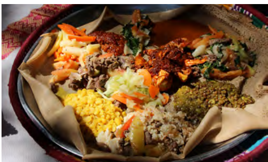
Traditional Ethiopian cuisine served on injera bread

“Ethiopia always has a special place in my imagination and the prospect of visiting Ethiopia attracted me more strongly than a trip to France, England, and America combined. I felt I would be visiting my own genesis, unearthing the roots of what made me an African.”