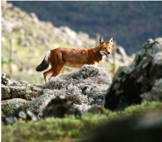
Ethiopian wolf in the Simien Mountains