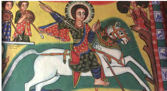
An Ethiopian depiction of St. George slaying the dragon

Today you drive to Mekele where you’ll catch a short flight back to Addis. You have the rest of the day to explore the capital and do some last-minute shopping. In the evening, enjoy a farewell dinner with traditional Ethiopian food, music, and dance before transferring to the airport for your flight home. A dayroom is provided at the SHERATON HOTEL. Next morning, your journey comes to an end as you arrive home.