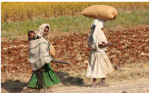
Ethiopian locals along the side of the road en route to Gondar