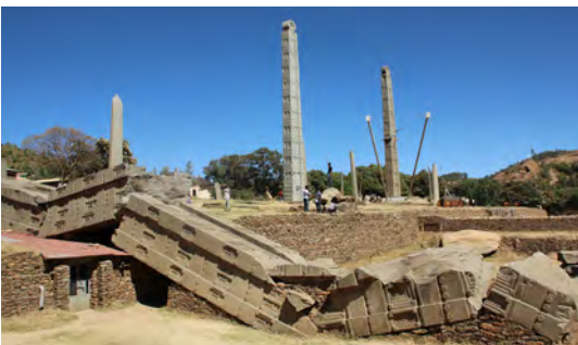
Ruins of Axum