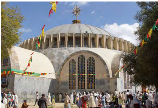
Church of Mariam in Axum