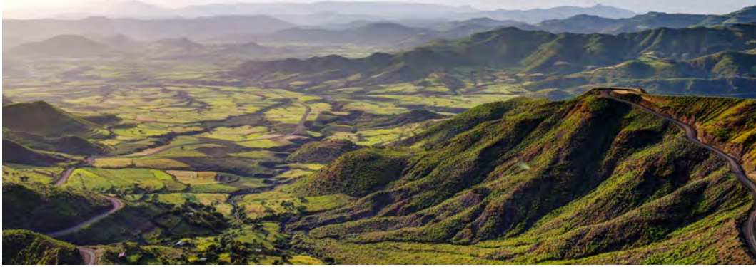
Simien Mountains and valley around Lalibela