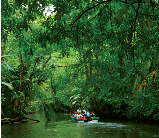
We explore Tortuguero canals on the optional post-tour extension.

Day 12: Depart for U.S. We transfer to the airport this morning for our return flights to the U.S. B