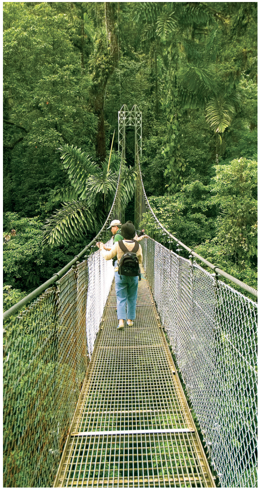
Enjoy treetop rainforest views from Arenal’s Sky Walk.