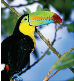
A colorful toucan

bird- and wildlife, including monkeys, iguanas, and crocodiles. After lunch together we return to our hotel mid-afternoon, with the remainder of the day at leisure along one of Costa Rica’s most beautiful Pacific Coast settings. B,L