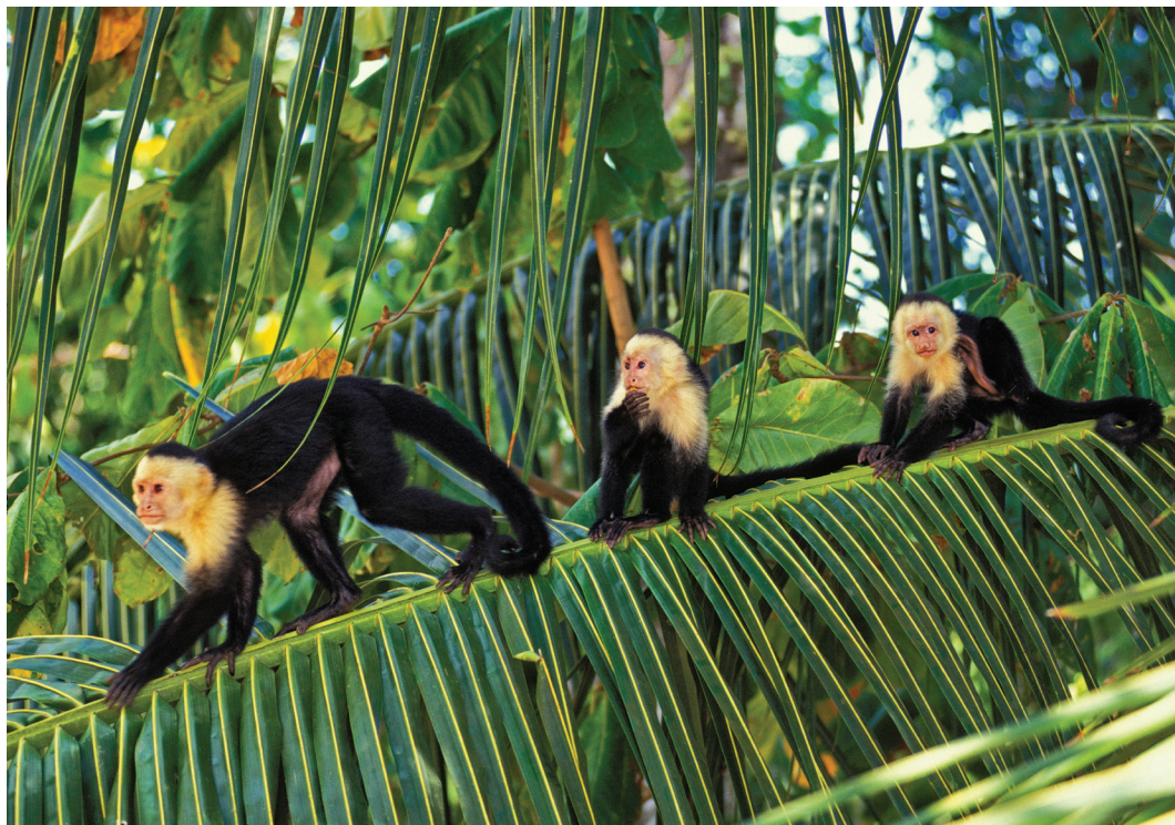
Capuchin monkeys abound in Costa Rica's rainforests.

Day 5: Arenal Region On this morning's visit to Arenal's hanging bridges Sky Walk, we have the special opportunity to experience the rainforest from the canopy level as we traverse a series of five suspension bridges high above the forest floor. While we observe the rainforest from a unique perspective, our naturalist guide will point out some of the flora and fauna that thrive here. Then we return to our hotel, where the remainder of the day is at leisure to relax amidst the beautiful grounds and thermal waters. Lunch and dinner today are on our own. B